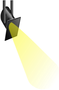
EXHIBIT SPOTLIGHT!!!! MIKE’S LUNCH BOXES

XXXXXXXXXXXXXXXXXXXXXXXXXXXXXXXXXXXXXXXXXXXXXXXXXXXXXXXXXXXXXXXXXXXXXXXXXXXXXXXXXXXXXXXXXXXXXXXXXXXXXXXXXXXXXXXXXXXX